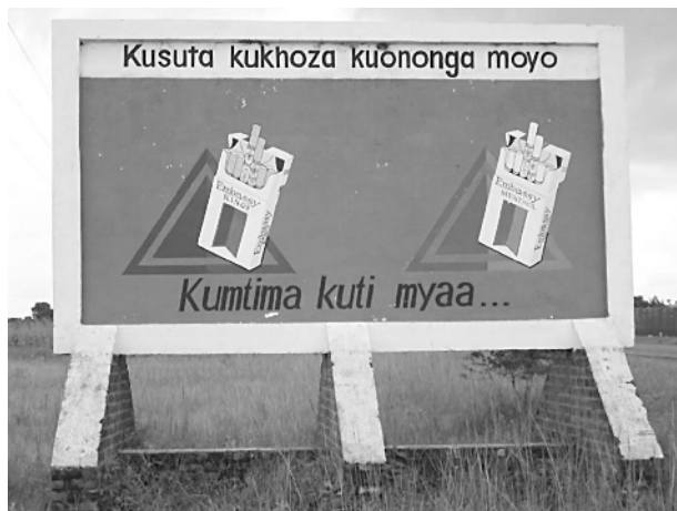
Figure 2 Mixed messages. “your heart is contented” (“Kumtima kuti myaa...”), and “Smoking may be harmful to your health” (“Kusuta kukhoza kuononga moyo”): British American Tobacco (BAT) advertisement for Embassy cigarettes, Lilongwe, Malawi, 2003. BAT used this ad as part of a larger marketing campaign to recruit new smokers during the same year that the company through the Eliminating Child Labour in Tobacco Growing Foundation (ECLT) claimed some success at reducing child labour in Malawi. 7 85 BAT aggressively markets cigarettes to women and children in Malawi to maintain and increase its market share (91%) of the local cigarette market. 97

BAT’s internal documents highlight that, rather than actively and responsibly working to solve the problem of child labour in growing tobacco, the company acted to co-opt the issue to present themselves over as a “socially responsible corporation” by releasing a policy statement claiming the company’s commitment to end harmful child labour practices, holding a global child labour conference with trade unions and other key stakeholders, and contributing nominal sums of money for development projects largely unrelated to efforts to end child labour.